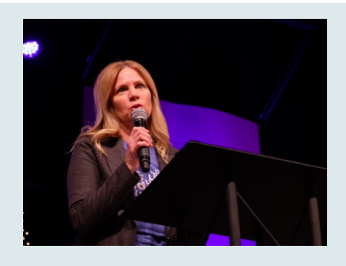
Host a Vida Speaker