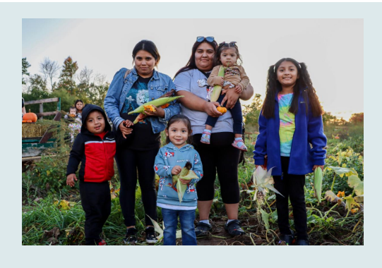
Host a Vida Playdate

Make a one-time, or recurring, financial gift to Vida. We also keep an updated materials registry list on our website if interested in hosting a drive for Vida. As a nonprofit, we rely on the generosity of donors to support our mission. Donate online here.