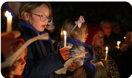
We had an amazing turnout for our caroling event!

We did it! Thanks to YOU, Vida won Carols for a Cause! Thank you to everyone who sang, voted, shared, and pestered friends to vote for Vida. We won with a record-breaking number of votes and received a $15,000 grant from Thrivent Member Network - East Wisconsin & Upper Michigan Region.