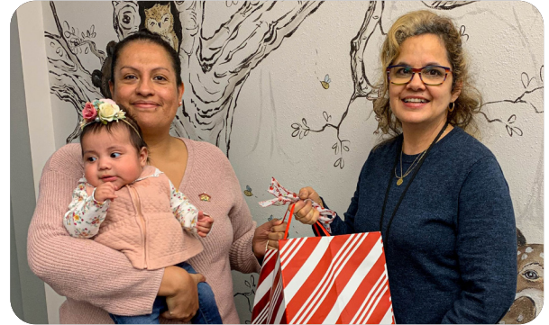
Each Christmas season, Adopt-A-Family blesses many Support Services clients and their families.

We are thrilled to report that Vida's 2024 Adopt-A-Family program was a huge success! We would not have been able to do it without the generous support of our Church Partners, as well as individual donors. Initially, we had 148 families sign up to receive Christmas gifts. However, due to the abundance of generous gifts and donations, we were able to bless an additional 34 families with Christmas gifts. In total, 182 families had presents under their trees to help create a Merry Christmas for their children. Each family received hats, gloves, and socks for each member of their family to stay warm during the cold winter months, along with a toy or book for each one of the kiddos. Thank you to each person who made it possible for Vida to bless those we have the honor of serving this past Christmas season!