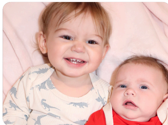
Some of our sweet babes at Trinity House.

Your generous support is providing a warm, loving, Christ-centered place for, at the writing of this article, 9 moms, 1 four-year-old, 6 babies, and 3 babies on the way, to call home.