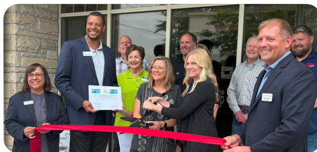
Envision Greater Fond du Lac and Charis helped welcome Vida to the Fond du Lac community.

Vida Medical Clinic opened its door to the Fond du Lac community on February 1, 2024. The mission alliance we've formed with Charis has allowed us to serve 75 patients and provide 91 medical services to the men, women, and students in Fond du Lac (statistics as of October 1, 2024). We celebrated this first medical clinic expansion with a ribbon cutting on June 21, 2024, and we are thankful for the many new Friends of Vida who joined us!