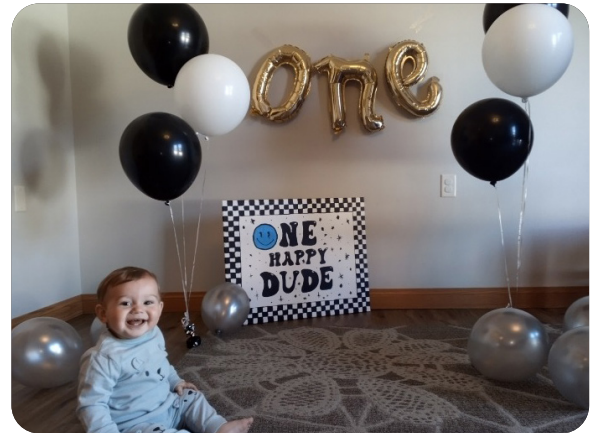
We recently celebrated the first birthday of one of our sweet babes in the maternity home.

Happy first anniversary to Trinity House! In this monumental first year of programming, as of October 1, Trinity House has served 24 women, 14 babies and toddlers, and 13 babies in the womb. Creating and running a brand-new maternity housing program has come with many challenges, but the abundant joy in the home far outweighs those challenges. We would like to thank all the amazing House Helpers, without whom this program wouldn't be possible, and of course, the donors and family foundations who have proudly supported this ministry expansion. We are especially thankful to the anonymous donors who gifted a second car for the house!