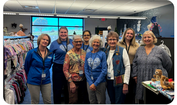
Vida Support Services staff with volunteers.

Check out our new website www.vidasupportservices.org ! We recently made the decision to separate our medical and support services websites because there are just too many wonderful things to highlight. We continue to provide one of the biggest and most robust support services programs in the Midwest, and likely the country! Thank you for your continued support of this life-changing program. We continue to look for new and innovative ways to build relationships and maximize our impact. Stay tuned for information about new dad's groups coming in 2025!