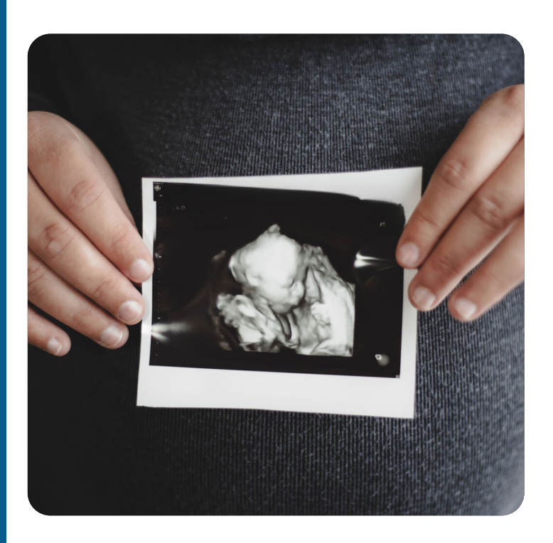
One of our Trinity House residents and her growing little one!