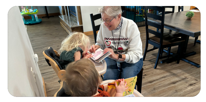
Trinity House volunteer reading to a resident's children.

Please see the engagement document for the many ways you can support Trinity House. We are most in need of financial donations to support the "home" stretch!